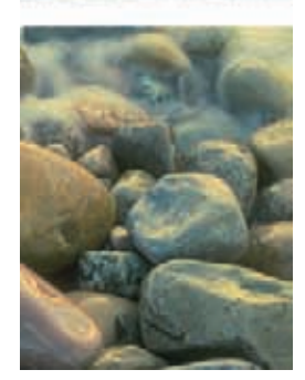
Environmental education can be described as a way of understanding environments, and how humans influence these environments.