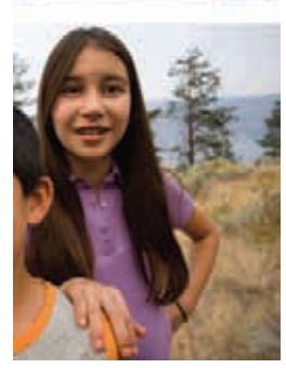
Students are viewed as constructors of their own knowledge rather than reproducers of others' knowledge. Further ideas related to this approach towards learning are described in the following section.