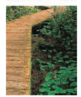
The study of environmental issues can enable students to develop what has been described as an environmental ethic.