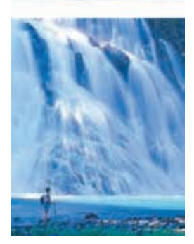
Direct experience with the environment is an important and vital way to learn.